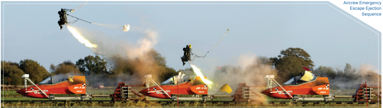
Aircrew Emergency Escape Ejection Sequence